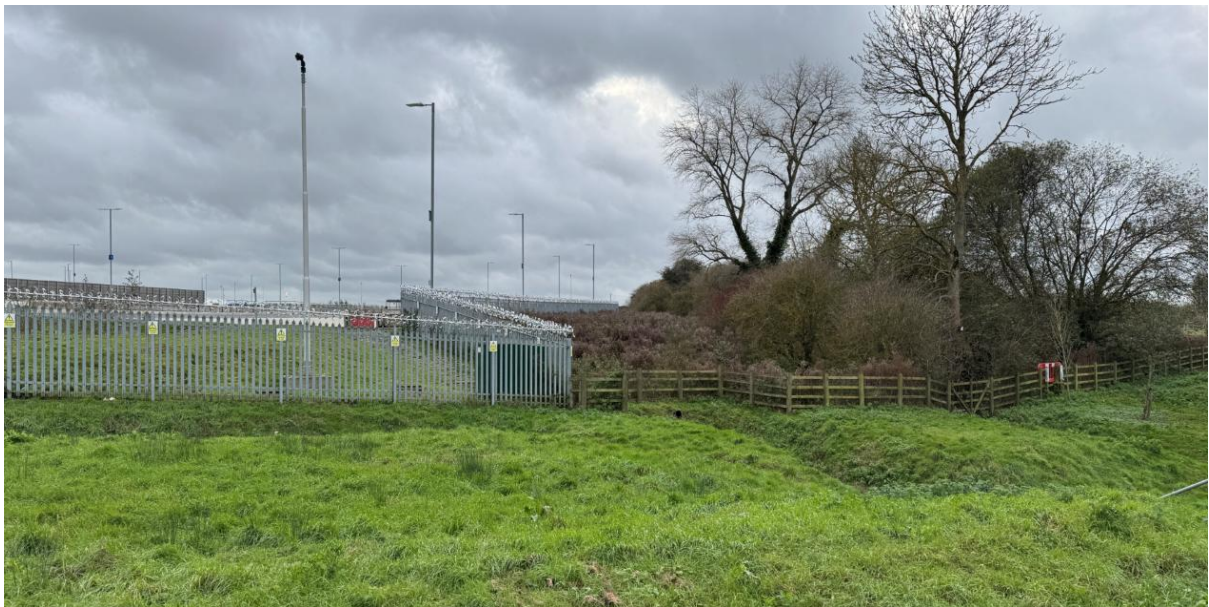
Existing ditch leading to Old Mill Stream near St Marys Church with adjacent site aesthetic.