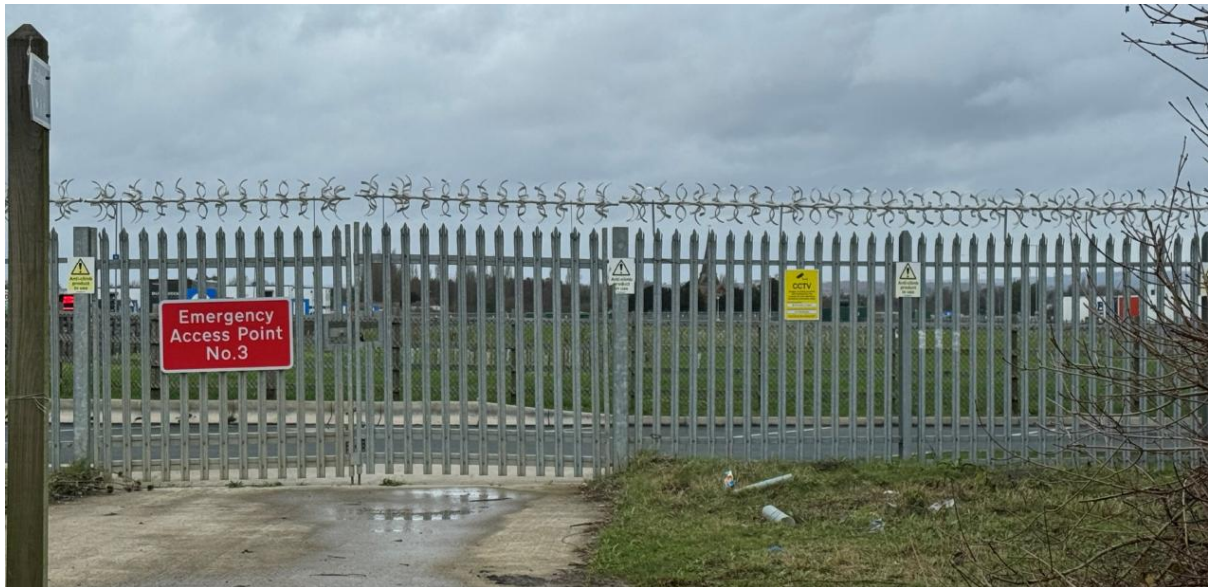
View towards St Marys Church from AE639 through the land to the east. St Marys can be seen to the left of the CCTV sign.