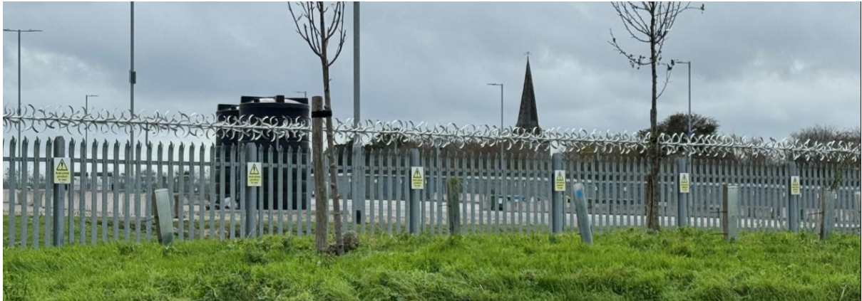
Detail view of St Marys Church from the A2070 J10A link.