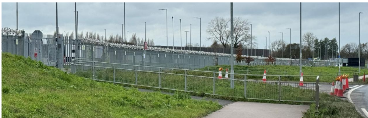
View towards St Mary's Church from the A2070 J10A link road to the north.