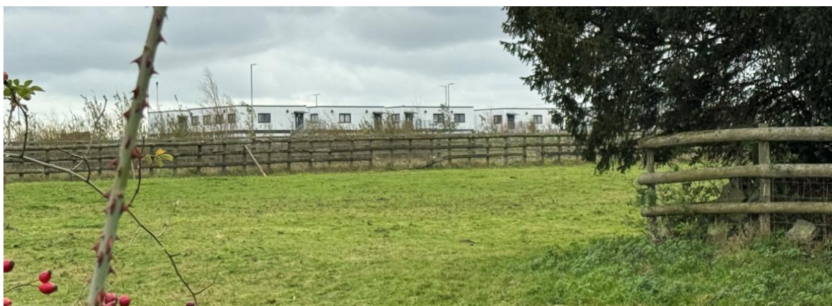
View of the site adjacent to St Marys Church.