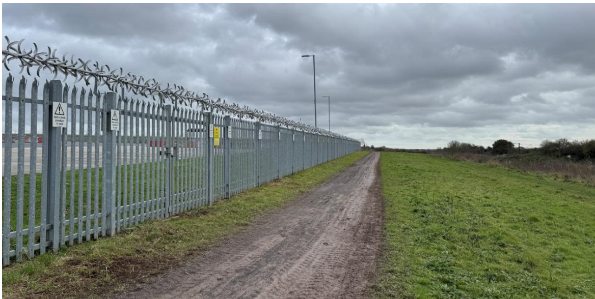
Boundary treatment facing countryside – southern part of the site.