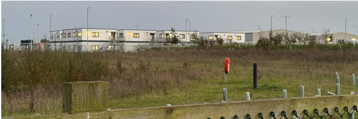
View of prefabricated buildings from the public footpath near to St Mary's Church.