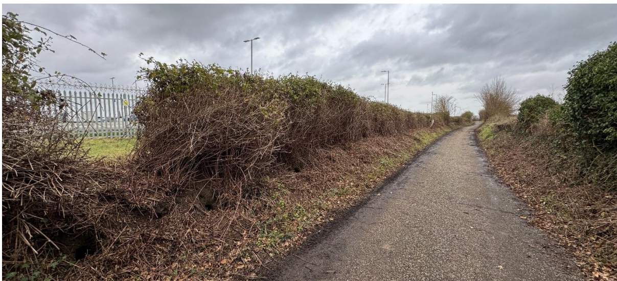
Example of how a buffer zone and existing hedging provide screening.