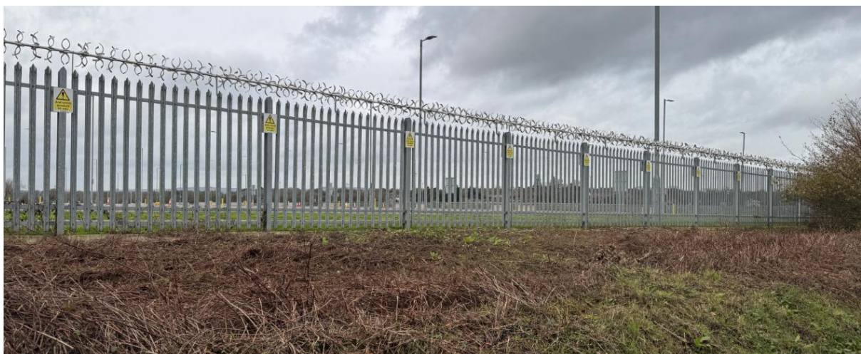
Areas where hedgerows appear to have been removed exposing the galvanised palisade fencing to the east of the site.