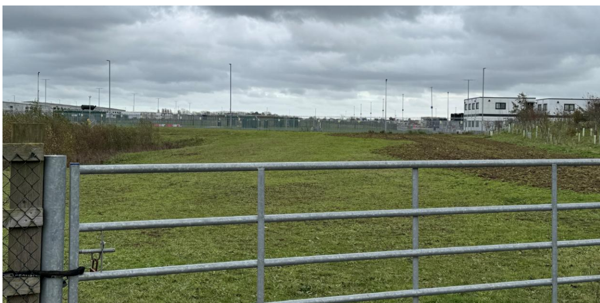
Views of buildings from the footpath across unplanted landscape in the position of the original route of AE639.