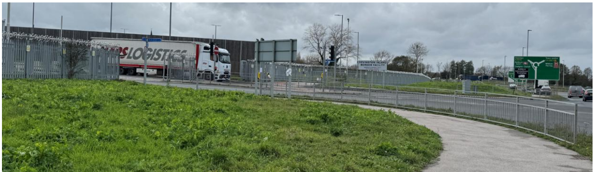
Site main entrance