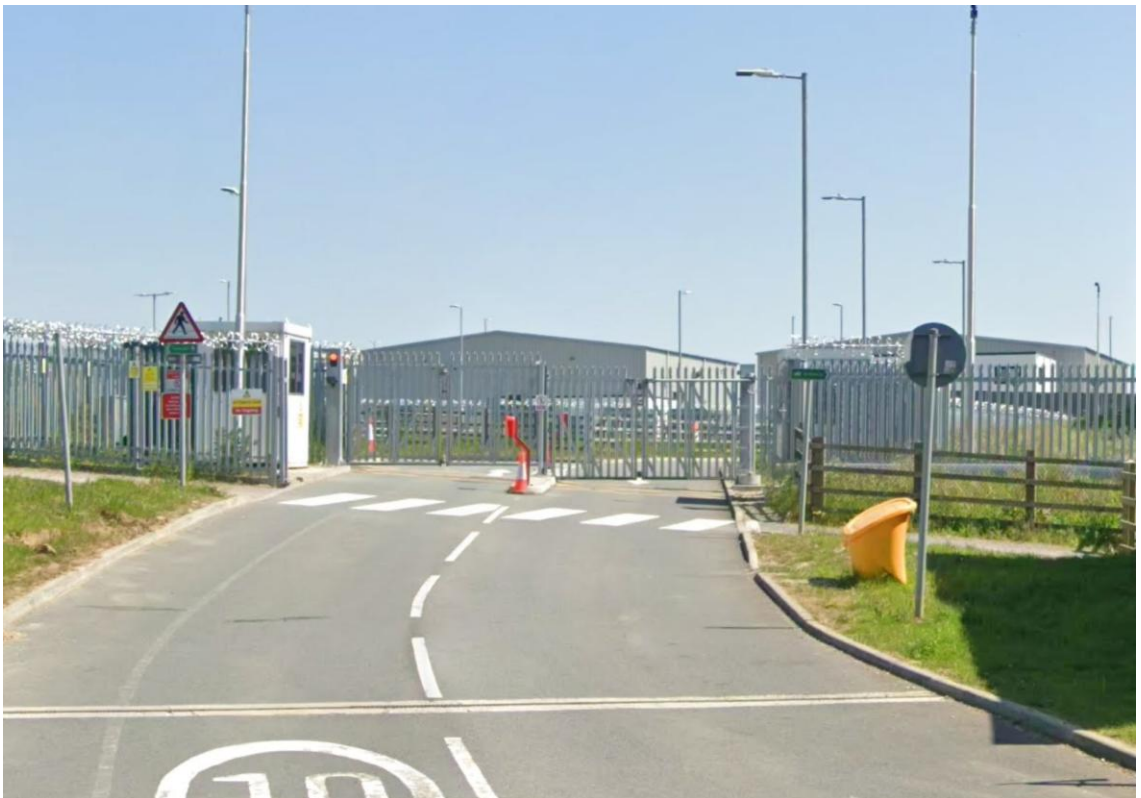
view from Church Road