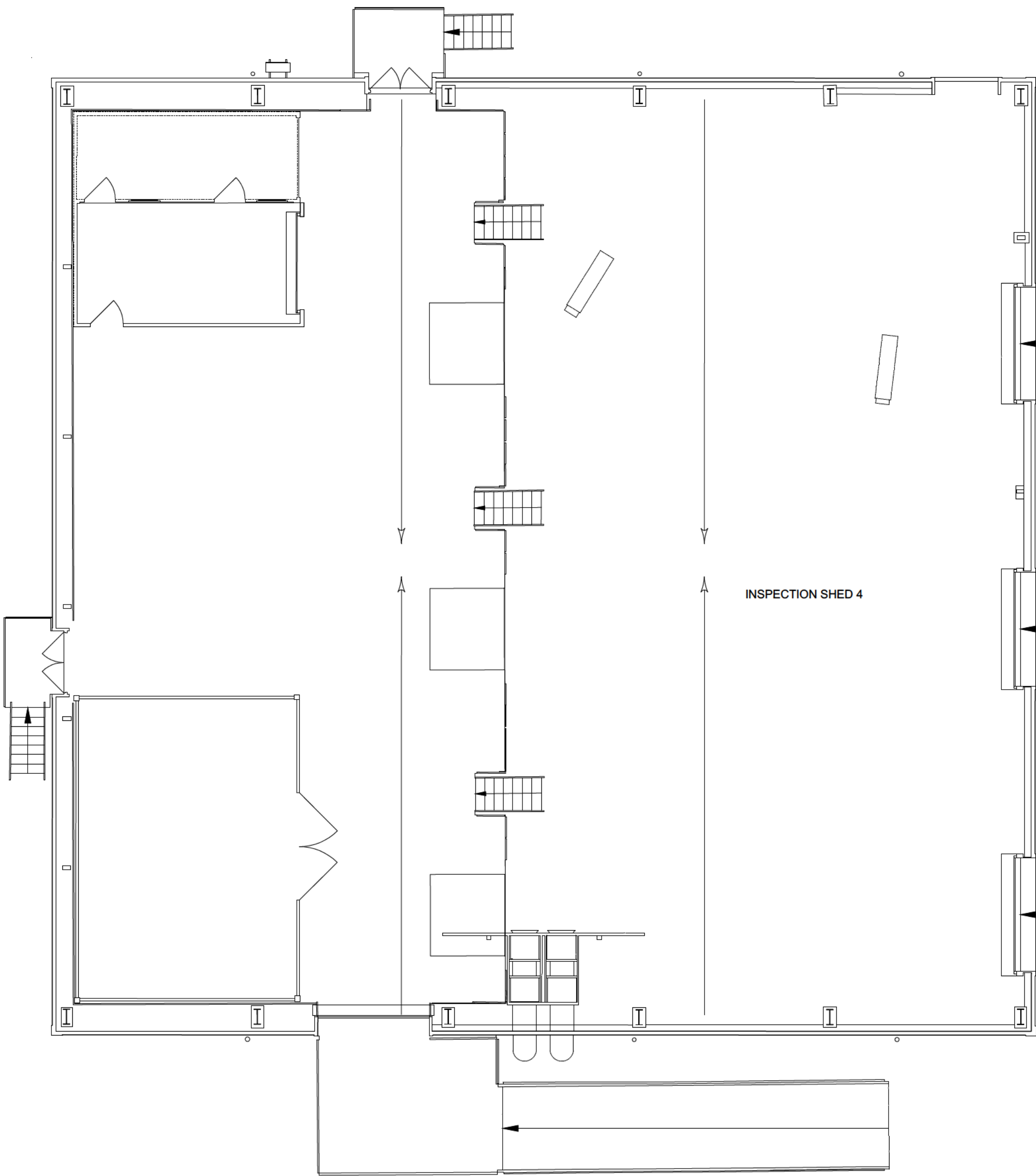
BUILDING 21 - INSPECTION SHED 4 GROUND FLOOR PLAN