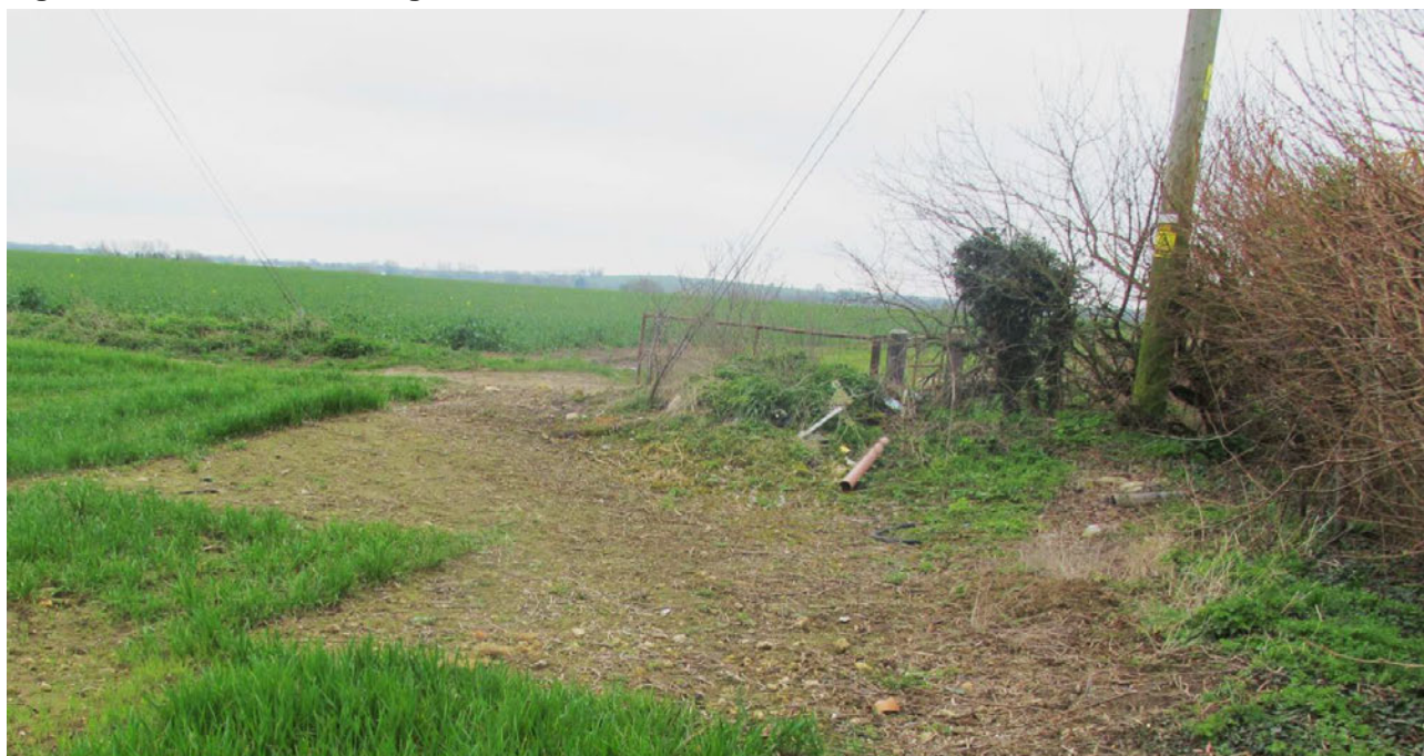
Figure 3.2: ROC Post, looking south, 2019