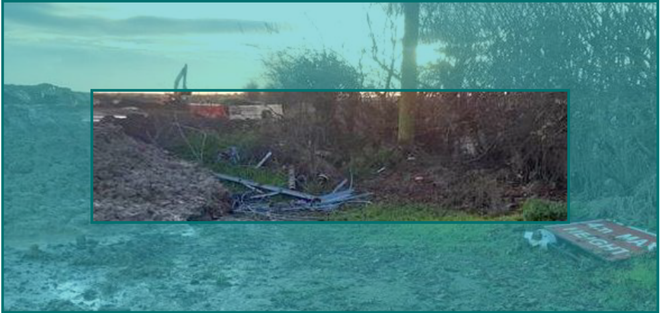
Figure 3.4: ROC post looking south, 2020 (asset highlighted in centre)

The following photos were taken during 2020. These photos show the area of containing the remains of the ROC post remaining undisturbed during construction of Sevington IBF and further contribute to the photographic record of the asset.