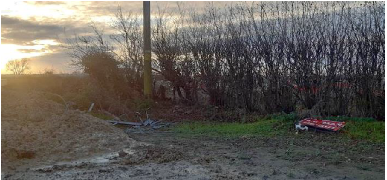
Figure 3.5: ROC post looking south-west, 2020