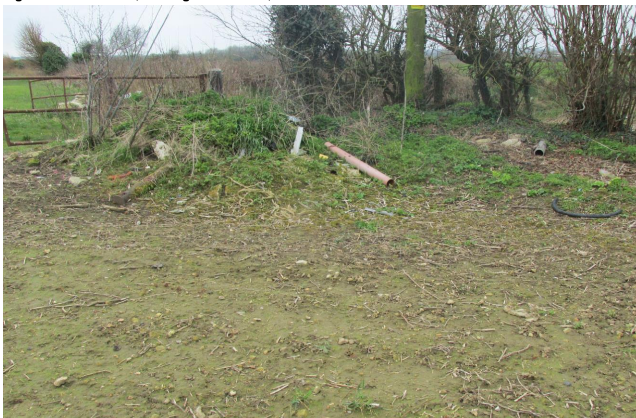
Figure 3.1: ROC Post, looking South-West, 2019

The first series of photos here provided were taken in March 2019 by WSP. These photos provide a photographic record of the above ground remains of the ROC post.