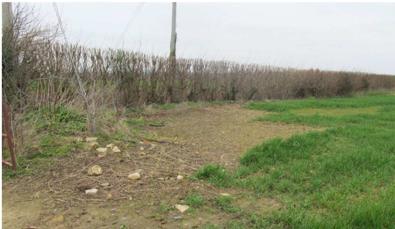
Figure 3.3: ROC post, looking north, 2019