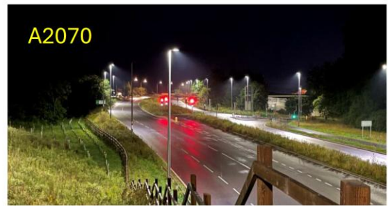
Comparison with new A2070 street lighting which has significantly better light pollution performance