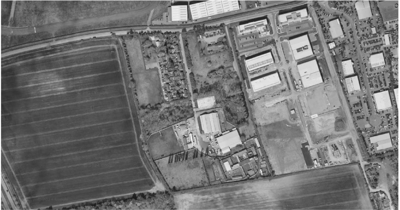
Figure 2.1 Site Location Plan, site boundary shown in pink © Google Earth 2024.